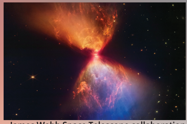
James Webb Space Telescope collaboration